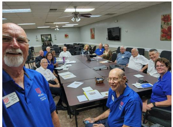
MOAA SCC Chapter Board & Guests