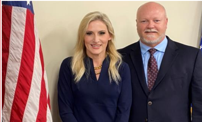
Congresswoman Laurel Lee and Chapter Legislative Liaison

As our Chapter Legislative Liaison, I found myself invited by Congresswoman Laurel Lee to participate in a Congressional Subcommittee regarding Elections. It was a roundtable on Military Voting. The meeting took place on May 4th at MacDill AFB. Led by Congresswoman Lee, the forum included Supervisors of Elections from multiple counties around the State of Florida. Those invited included veterans from a variety of veterans organizations and former and current spouses of veterans. The backgrounds of invitees ranged from business owners, those with legal careers, and volunteers. The goal was to garner historical perspectives about military voting from past and present military members and family members for consideration with the upcoming generation coming of age to vote.