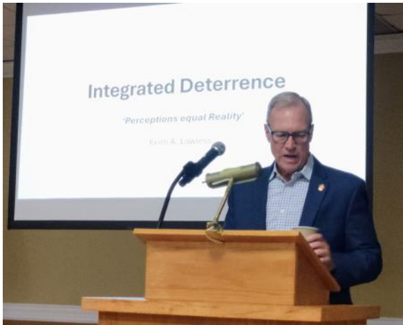
Col Keith Lawless, USMC (Ret) speaks on Integrated Deterrence .