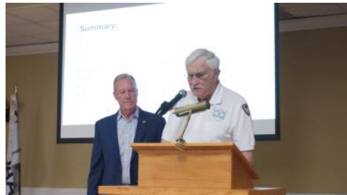
Bullet recognizing a superb presentation!