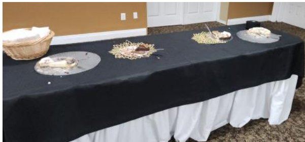
Our members seem to have sweet teeth!