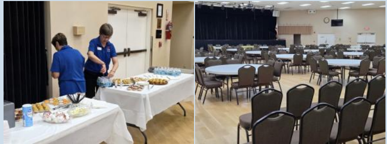
Refreshments setup and the calm before the storm.